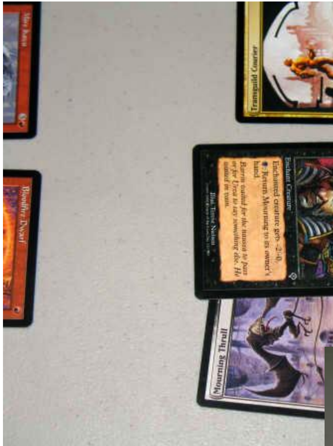
Round 6 vs. Eric Bare

Walking around the tables, this pic was too amusing not to share: